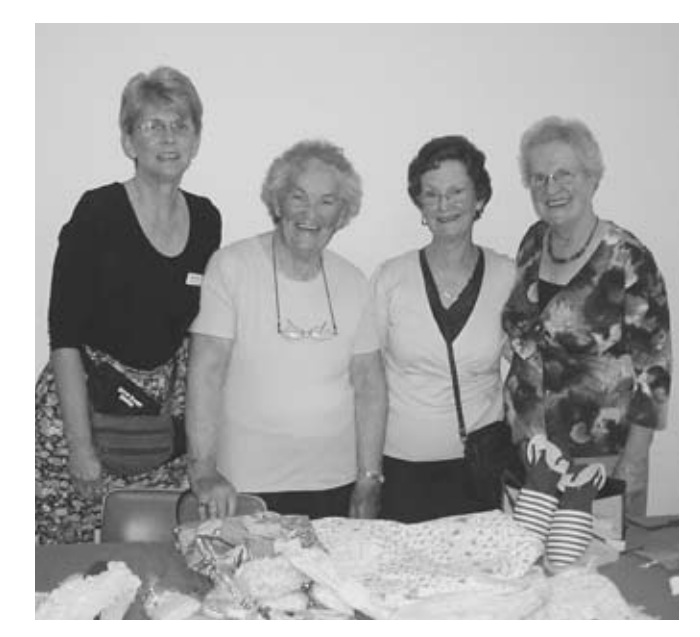
Revesby Ladies Group.

Revesby Ladies' Group deserves our heartfelt thanks for a magnificent effort to "Ease the Burden and Find a Cure".